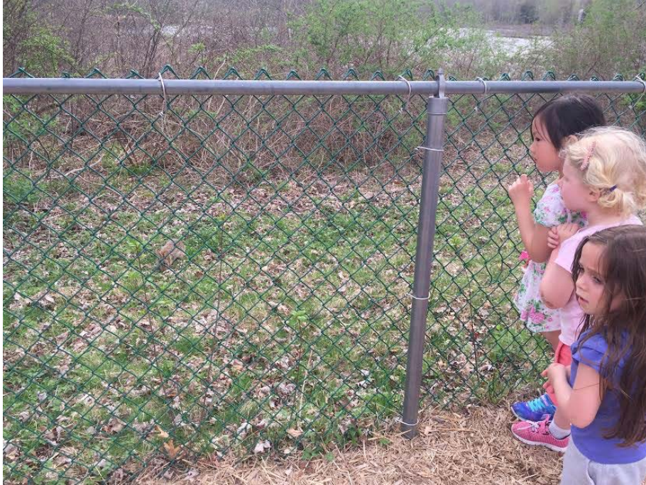
With a calm presence, the Dolphins quietly observed a bunny nibbling on clover behind the playground fence.