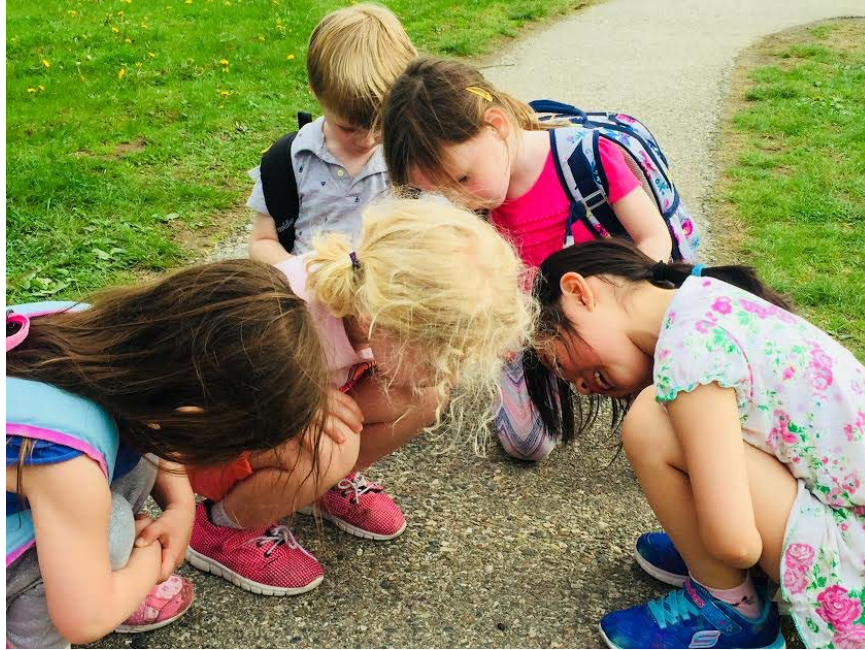
The Dolphins are closely examining an insect on their way to the playground.