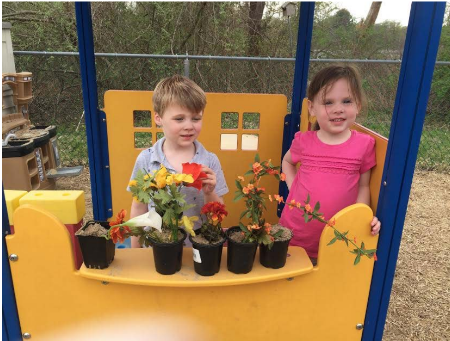
After carefully planting silk flowers, the Dolphins are ready for business.